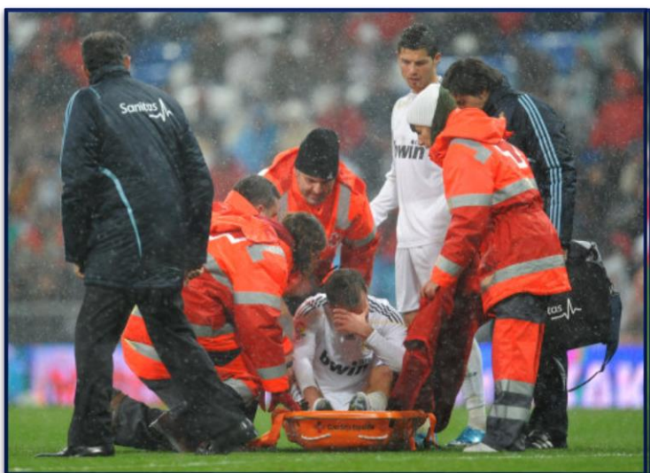
Pic 2: medical staff

In all competitions, it is a requirement that a stretcher team and a pitchside emergency doctor be available on matchday from at least the point at which the teams arrive at the stadium/hall until their departure.