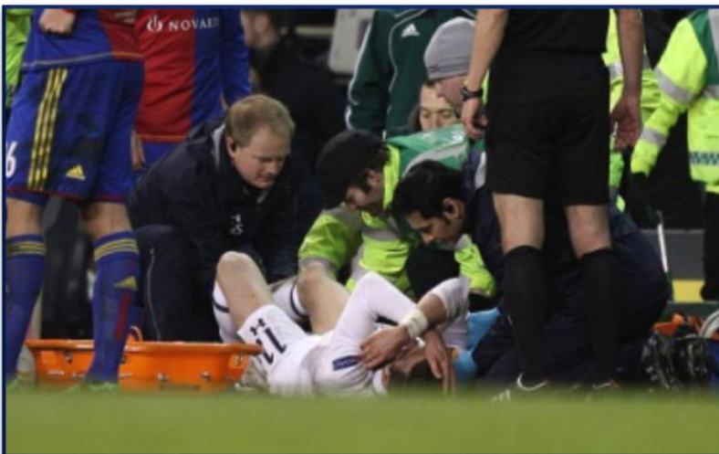
Pic 4: pitchside medical equipment

A: No. However, all items specified as being required at pitchside and all items specified as being required in the medical room must be provided. If the pitchside doctor chooses to have some of the medical room items with him/her at pitchside instead of keeping them in the medical room, this is acceptable, provided that this would in no way impair treatment of an injured player.