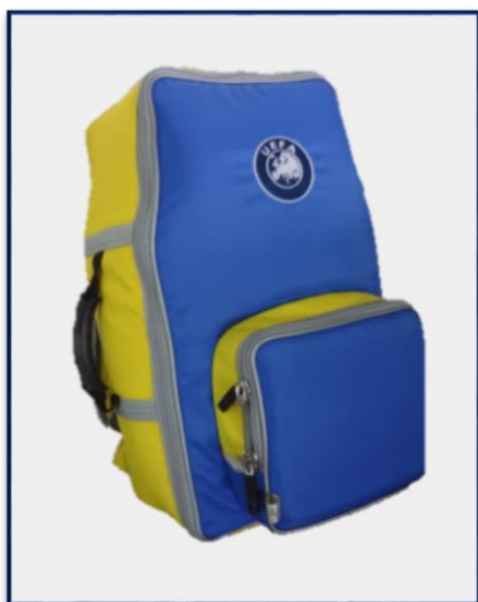
Pic 1: The emergency bag

In the event of queries relating to UEFA's Minimum Medical Requirements, please speak to the match delegate or contact the UEFA medical unit on +41 (0)22 707 2666 or send an email to medical@uefa.ch