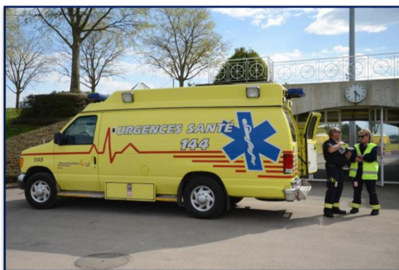
Pic 3: the ambulance

Where the referee trains some time before or after the start or finish time of the visiting team's MD-1 training session, it is for the host club/association to decide whether medical support will be provided. However, the host club/association should aim to provide suitable assistance wherever possible.